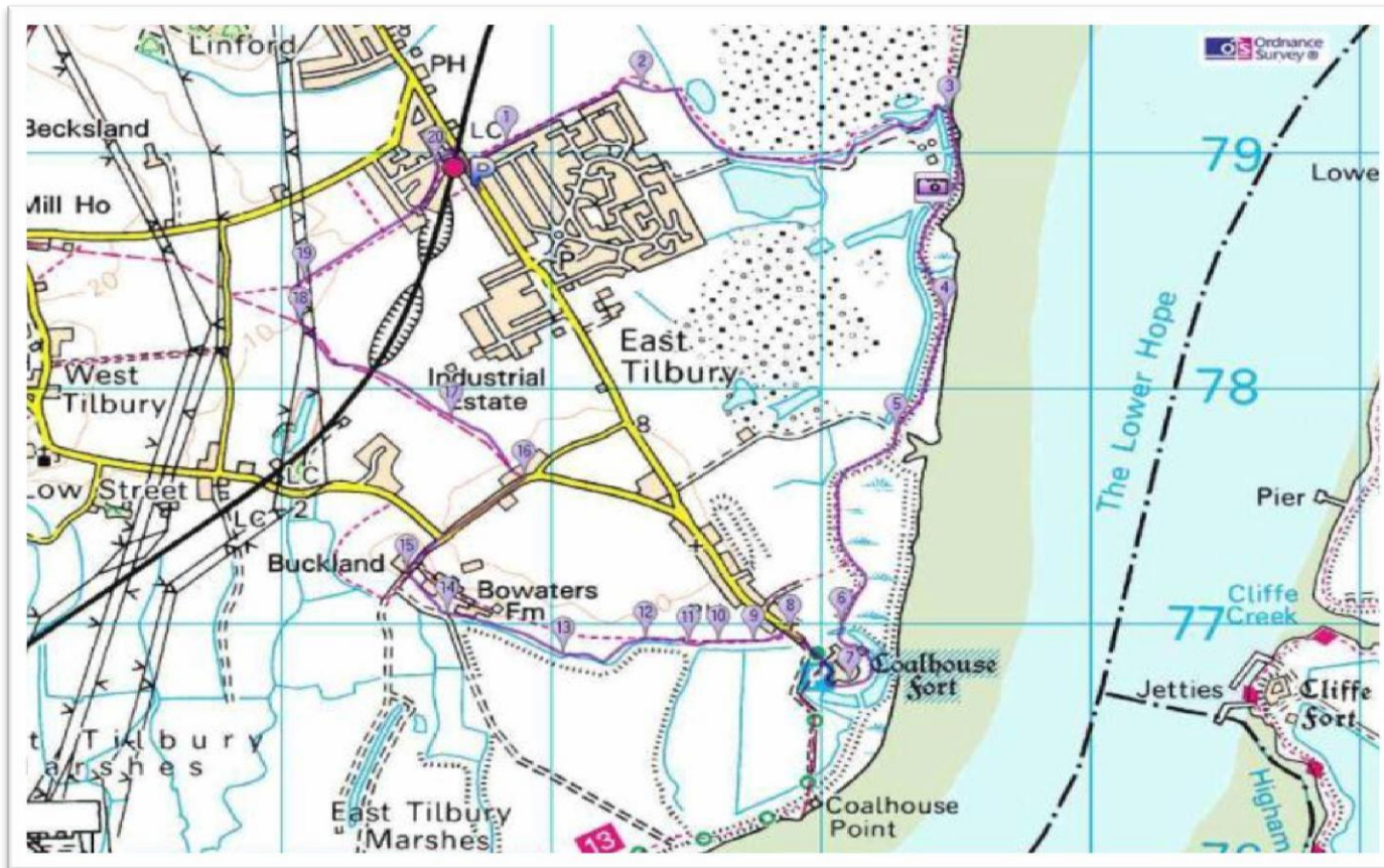
Coalhouse Fort, Essex

Step One: Identify the heritage assets affected and their settings